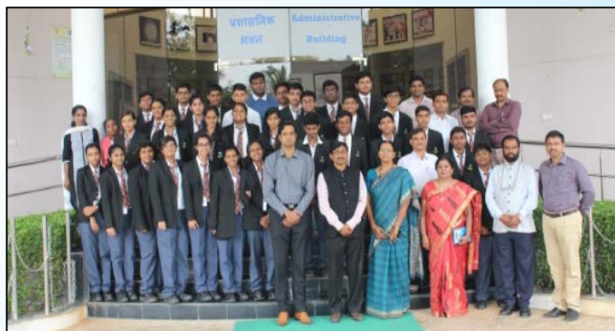
Agricultural Education day was celebrated at ICAR-NIVEDI by organizing sensitization programme for School students from Nagarjuna Vidyaniketan School, Yelahanka on 4 th December, 2017.