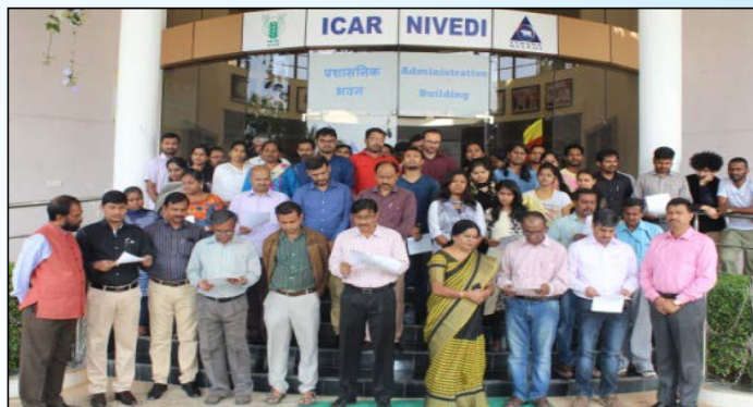
On the occasion of Constitution day, Preamble of the Indian Constitution was read by staff members of ICAR-NIVEDI on 27 th November, 2017.