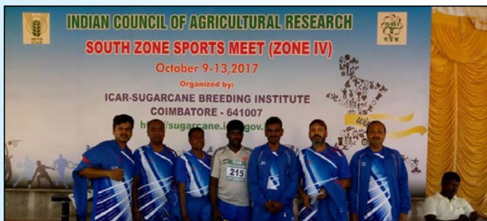
ICAR-NIVEDI participated in the ICAR-South Zone sports meet held at ICAR-Sugarcane Breeding Institute, Coimbatore during 9-13 th October, 2017.