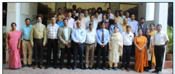
25 th Annual Review meeting of AICRP on ADMAS of ICAR-NIVEDI held during 26-27 th October, 2017 at Disease Investigation Section, Aundh, Pune and reviewed the progress of the work done for the year 2016-17.