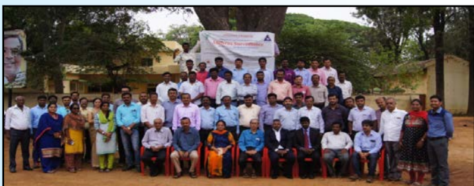
ICAR-NIVEDI organized Orientation cum Technical seminar on 'Anthrax surveillance' for Veterinary and Medical professionals from Chikkaballapur and Kolar districts on 11 th August, 2017.