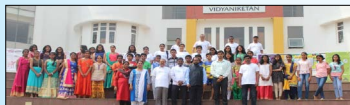
World Antibiotics Awareness week was celebrated at ICAR-NIVEDI during 13-19 th November, 2017 and imparted awareness on use of antibiotics and antimicrobial resistance to ICAR-NIVEDI staff members and school children of Kendriya Vidyalaya, CRPF, Yelahanka, Kendriya Vidyalaya, RWF, Yelahanka, Nagarjuna Vidyaniketan School, Ramagondanahalli and KBM Blossom Public School, Marasandra on this occasion.