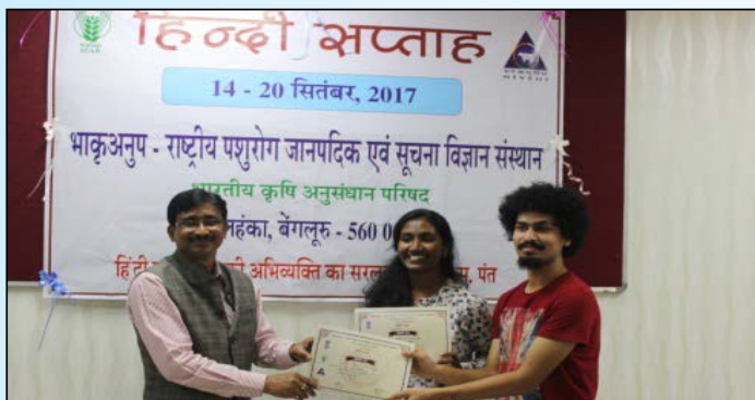
Hindi Saptah was celebrated during 14-20 th September, 2017 at ICAR-NIVEDI and various competitions like extempore speech, essay writing, letter writing and debate were organized and distributed certificate and prizes to winners on the occasion.