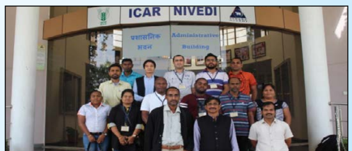
International trainees from Central Poultry Development Organization, Hessarghatta visited ICAR-NIVEDI facility and interacted with scientists on 5 th December, 2017.