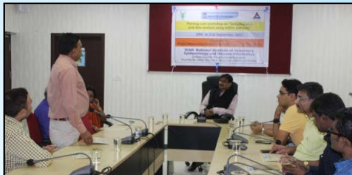
ICAR-NIVEDI organized DBT-PMU sponsored training cum workshop on 'Sampling plan and data analysis using online software' to the Network project staff members during 20-21 st September, 2017.