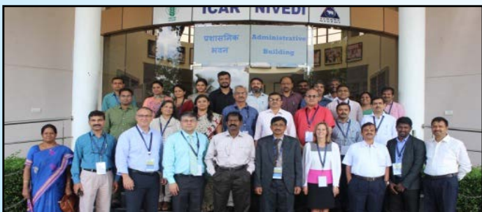
CDC and American Society for Microbiology sponsored workshop on 'Laboratory Capacity Building for Leptospirosis' organized jointly by ICAR -NIVEDI and CDC, Atlanta, USA at ICAR-NIVEDI during 11-15 th September, 2017.