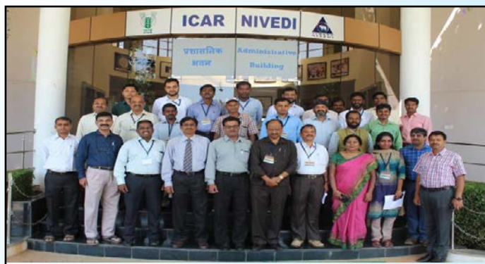
ICAR-NIVEDI organized ICAR short course on 'Advances in Risk Analysis and GIS based prediction modeling of livestock parasitic diseases' held during 23 rd October-1 st November, 2017.