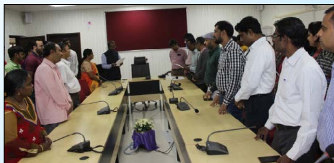
ICAR-NIVEDI staff took pledge for New India on the occasion of 75 years of Quit India Movement on 9 th August, 2017.